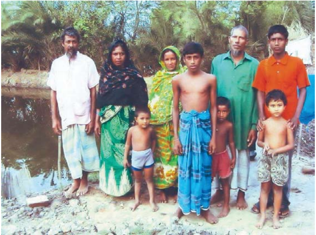
Landless people of Jayedanagar

The united landless in nine villages of Kaliganj Upazila under the Satkhira district have established ownership of their land at the cost of a life. The glory of dying in the struggle to establish one's rights goes to deceased leader Jayeda – after whom the village has now been renamed. This is a unique case in the history of the movement to uphold the rights of the landless.