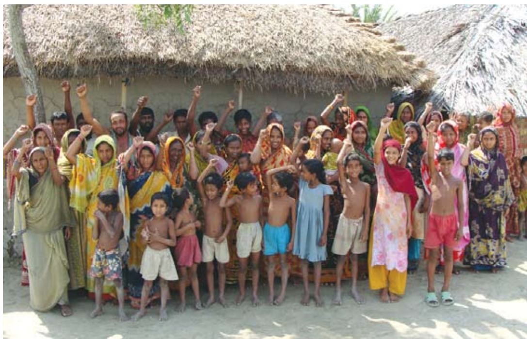
The landless people of the Jamuna Shoal