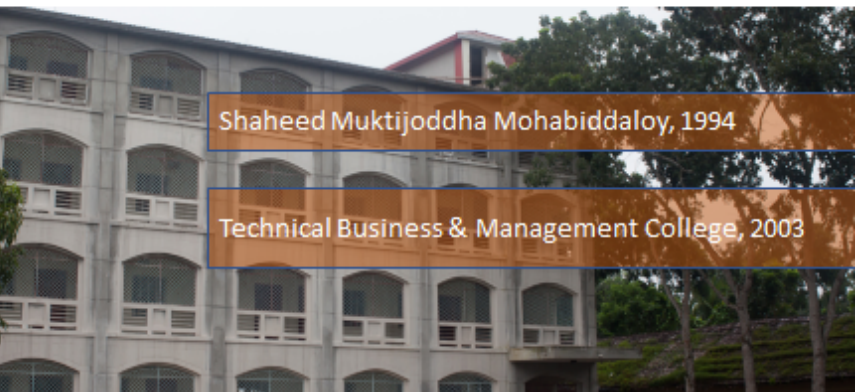
Shaheed Muktijodha Mohabiddaloy, 1994