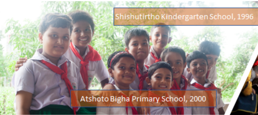
Shishutirtho Kindergarten School, 1996