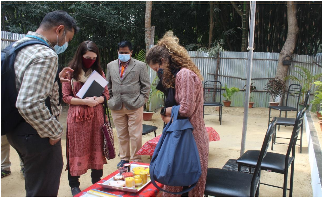
Representatives from Global Affairs Canada and UNDP Bangladesh visited Uttaran's skills programme at Ukhyia