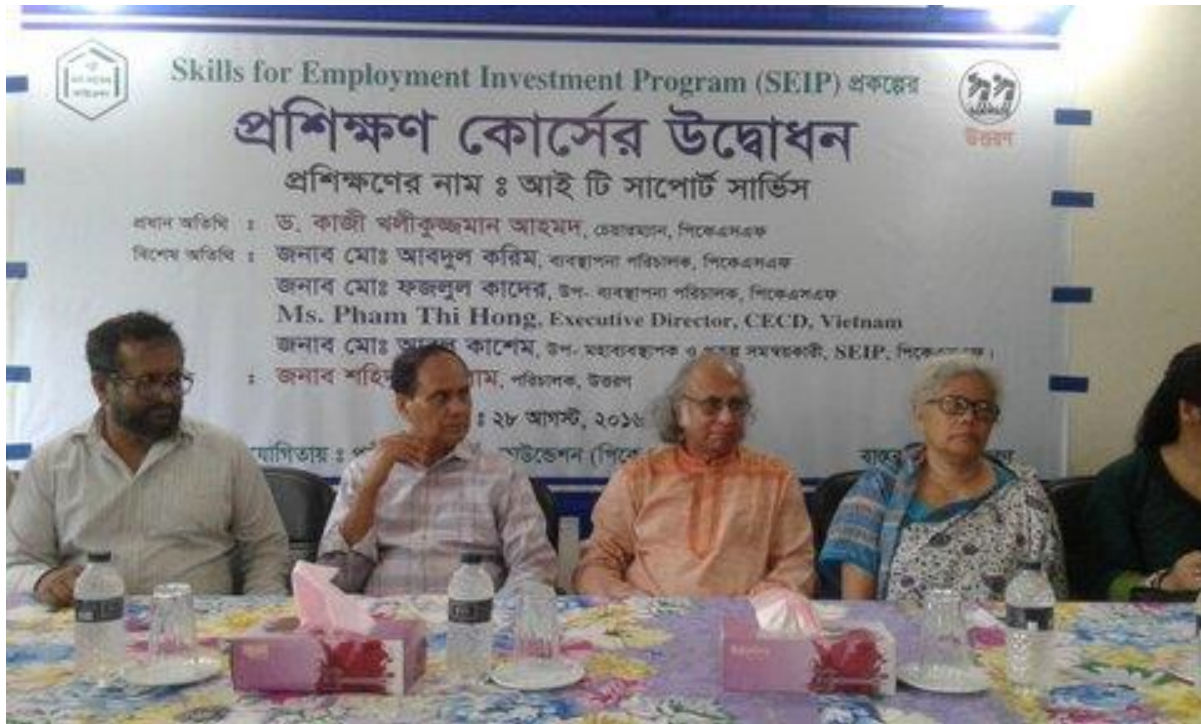
Inauguration ceremony of SEIP project