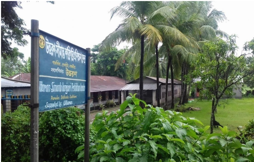
UttaranShemanto Technical Training Centre, Debhata, Satkhira