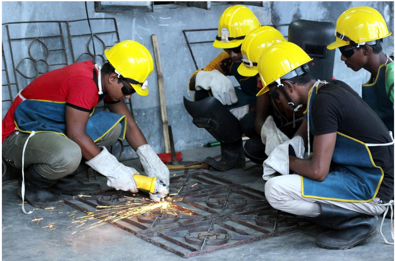
Youths are receiving technical training from UttaranChuknagar Technical Training Centre