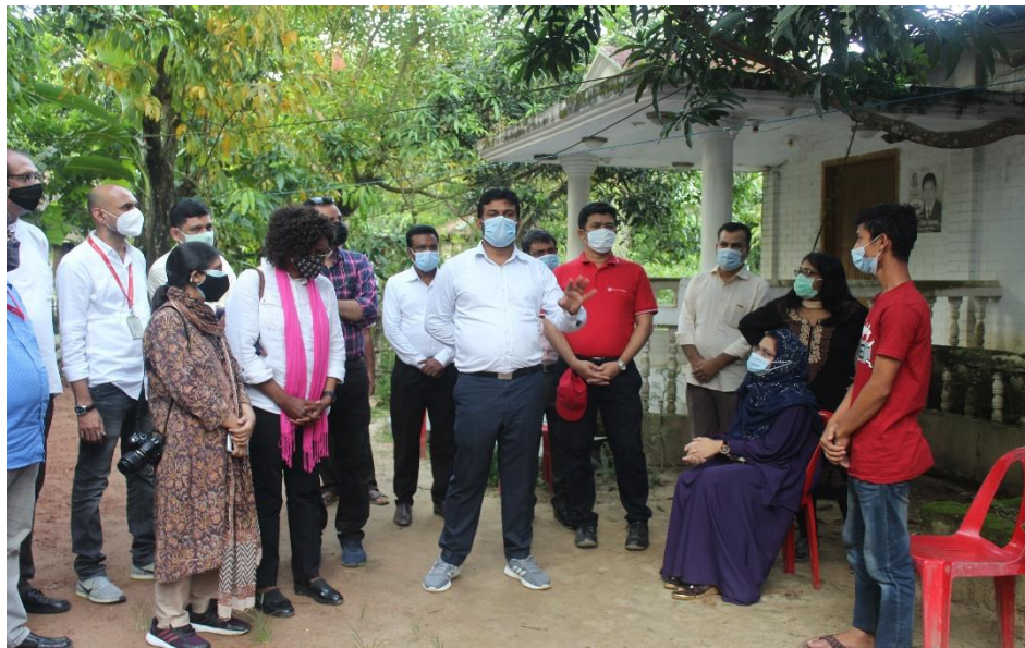
Project Director of ROSC Phase II, World Bank and Sae the Children's representatives visited Uttaran's skills programme