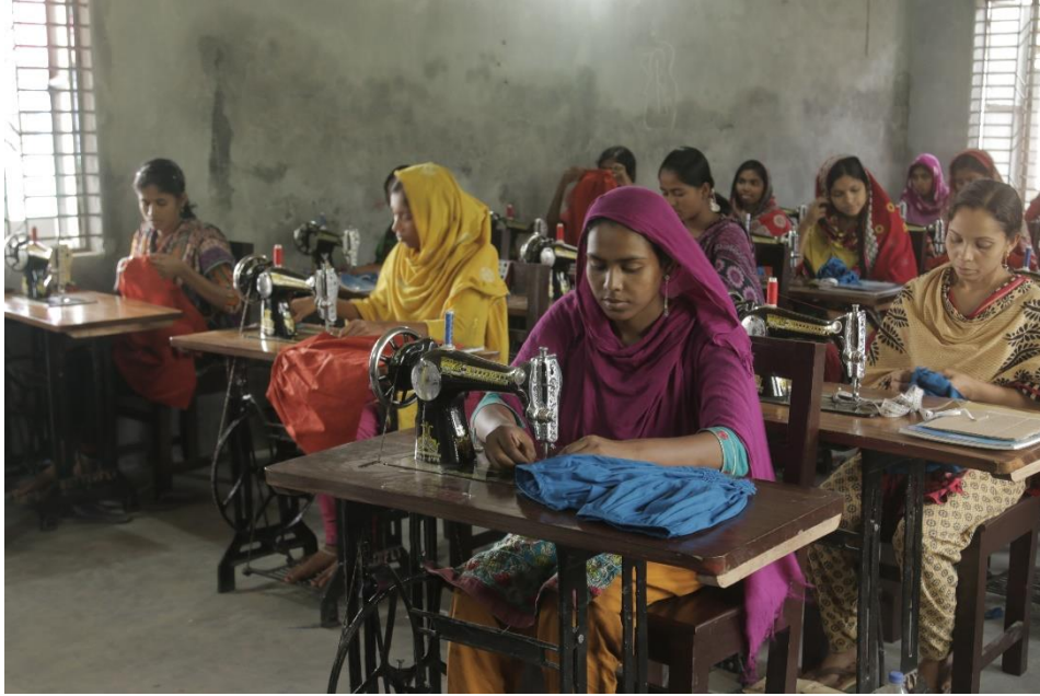
Youths are receiving technical training from UttaranChuknagar Technical Training Centre