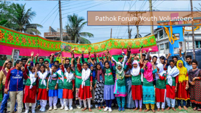
Pathok Forum Youth Volunteers