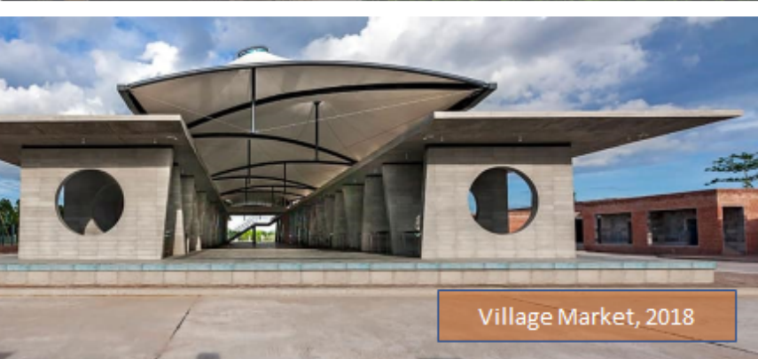
Village Market, 2018