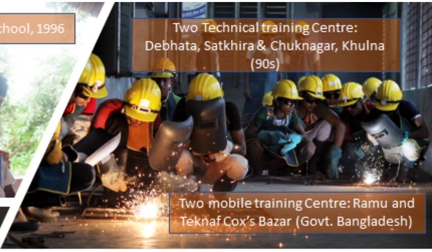
Two Technical training Centre: Debhata, Satkhira & Chuknagar, Khulna (90s)