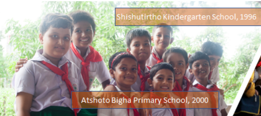
Shishutirtho Kindergarten School, 1996