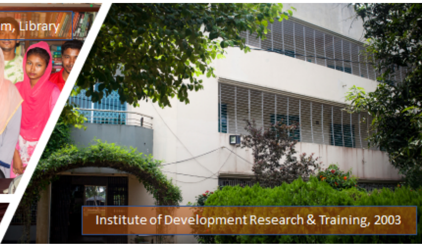
Institute of Development Research & Training, 2003