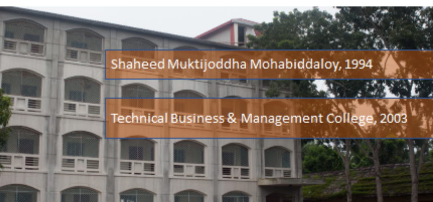
Shaheed Muktijoddha Mohabiddaloy, 1994