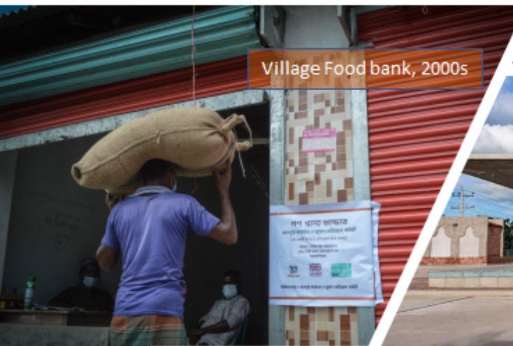
Village Food bank, 2000s