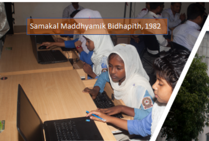
Samakal Maddhyamik Bidhapith, 1982